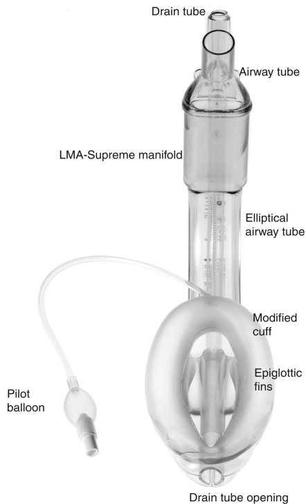
Fig 2 View of LMA-Supreme™ revealing epiglottic fins.